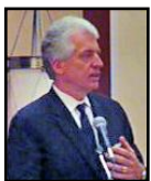
Jim Slattery Congressman

The highlight of the Sarasota prayer breakfast is a message by a guest speaker. In recent years the speakers have been U.S. Senators, U.S. Congressmen, Foreign Ambassadors, and State Representatives, many of whom have participated in the National Prayer Breakfast held annually in our nation's capital.