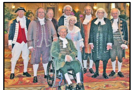
The Founding Fathers Prayer Breakfast 2010